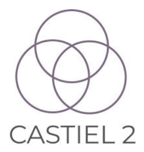
CASTIEL 2 – Coordination & Support for National Competence Centres on a European Level Phase 2