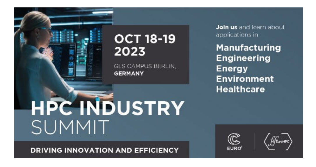
Figure 3: Visual Identity of EuroCC@Montenegro

For the communication of the conference, a visual identity has been created for the dissemination of the event (see Figure 3):