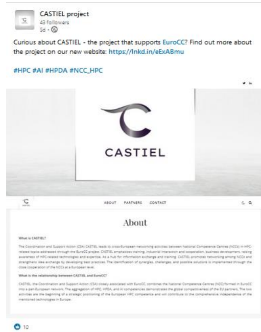
Figure 3: CASTIEL LinkedIn Profile.

A Twitter list with all the project partners was created [5] and, once all NCCs' social media profiles will be set up, a new list with an overview of the NCCs will be added, too. CASTIEL ensures to tag the relevant partners and other parties involved on each social media post, which helps to increase the content's reach and thus the project's visibility.