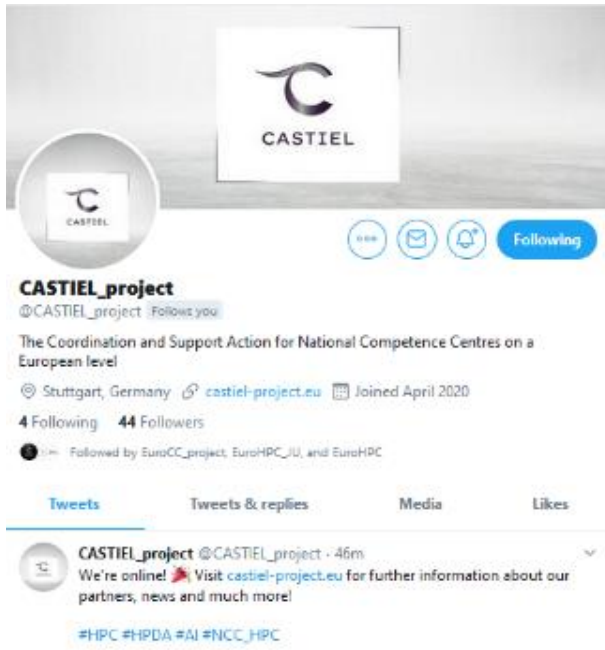
Figure 4: CASTIEL Twitter Profile.